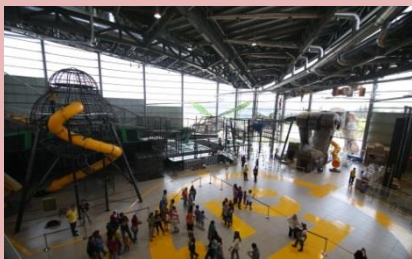
"District 21" attraction in IOI City Mall Putrajaya

Location : IOI City Mall Lebuh IRC, IOI Resort City, Putrajaya Contact : +603-8328 8899 Website : www.ioicitymall.com.my