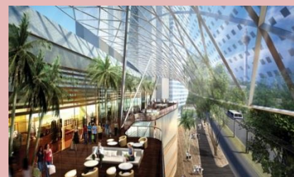
"Sky Alfresco Dining" attraction in Quill City Mall

Location : Quill City Mall Jalan Sultan Ismail, Kuala Lumpur Contact : +603 2603 1018 Website : www.quillcitymall.com.my